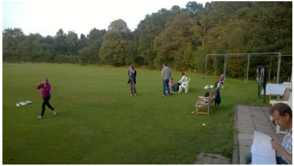
14^{th} followed by Sudhakar in the 15^{th} 1-30 has turned into 6-55.

Never mind only a bit north of 9 an over required for 20 overs, that'll deserve a beer when I'm done. Wiggy has been holding out during the crisis and we start to rebuild but the fast full straight bowling yields little. When we finally get going at a decent rate of 15 overs it's still not meeting the required run rate. I get bowled and Will gets caught by Matthew leaving the Watkins to hold out till the bitter end denying them 10 wickets. Lucas the only one of us managing a strike rate above 100 with a stonking 4 towards the nets.